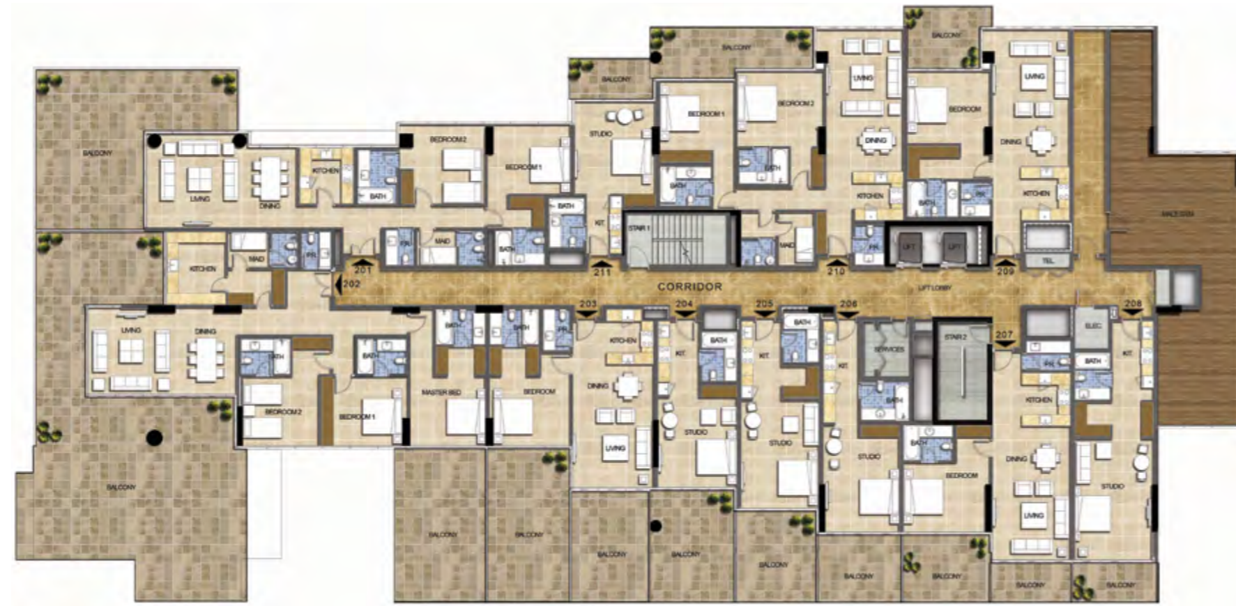
GOLF VEDUTA | GOLF TERRACE TOWER A - LEVEL 02