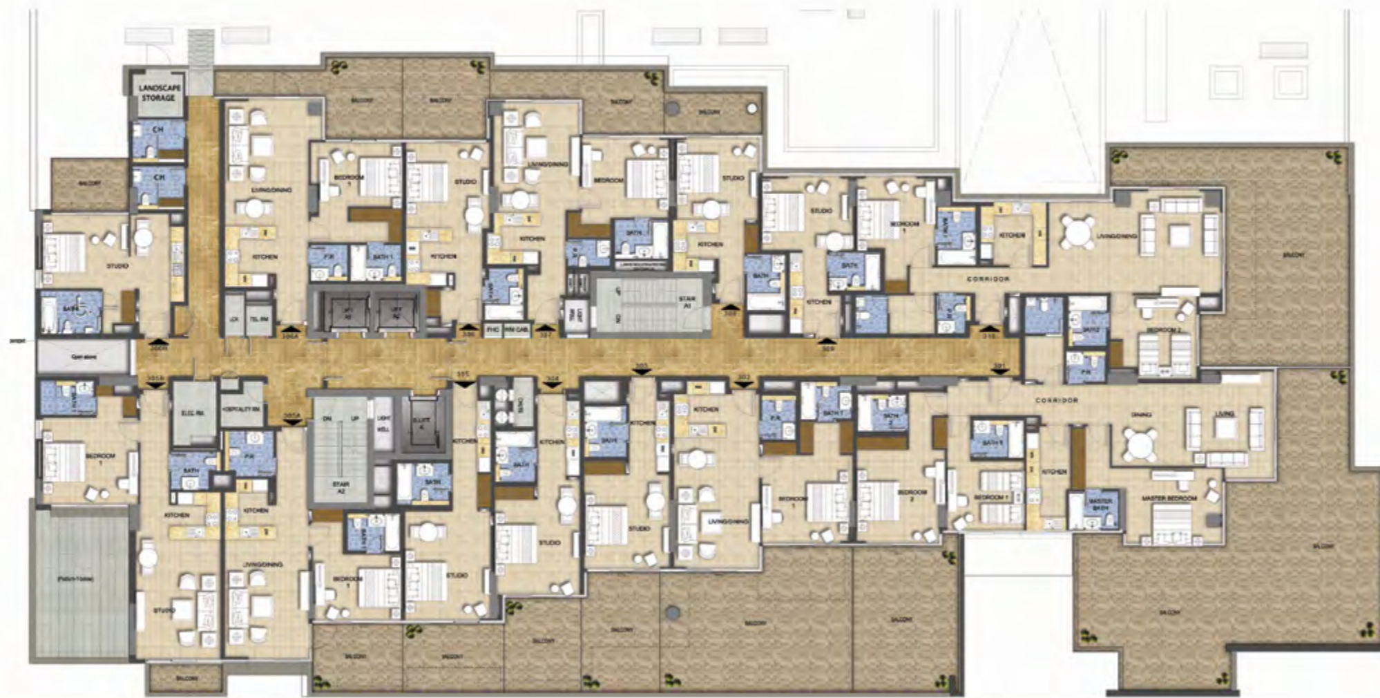
GOLF PROMENADE 2 TOWER B - LEVEL 03