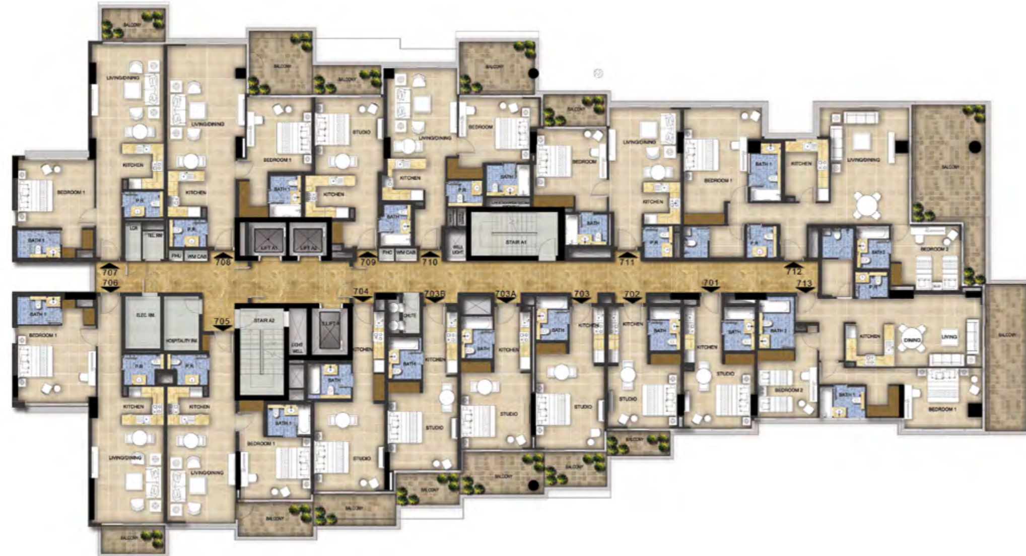
GOLF PROMENADE 2 TOWER B - LEVEL 07