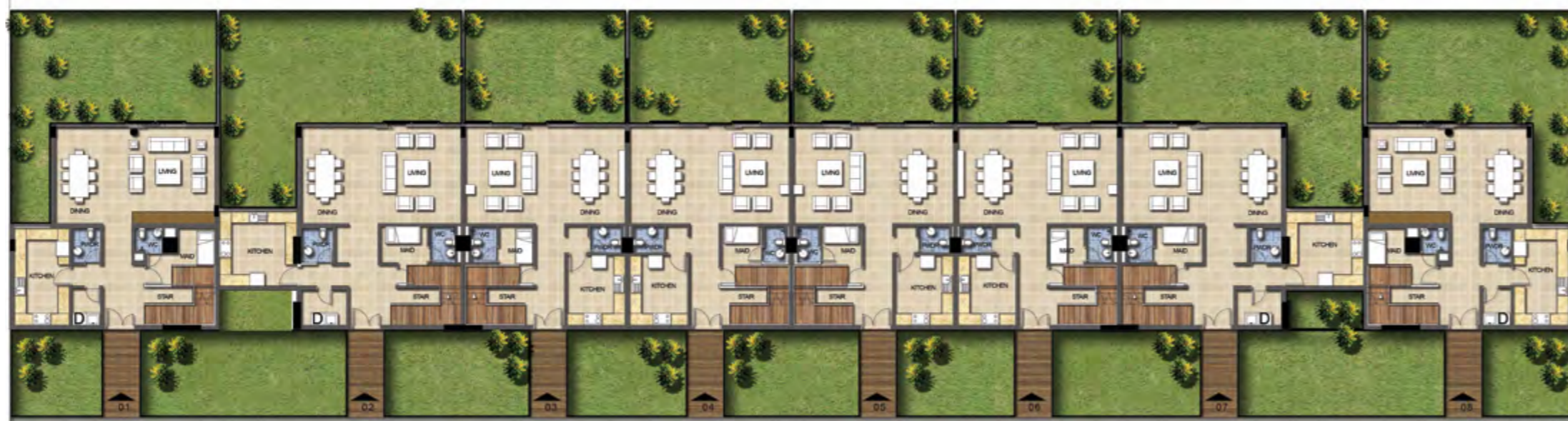
GOLF PROMENADE 3, 4 & 5 TOWER A&B - GROUND LEVEL