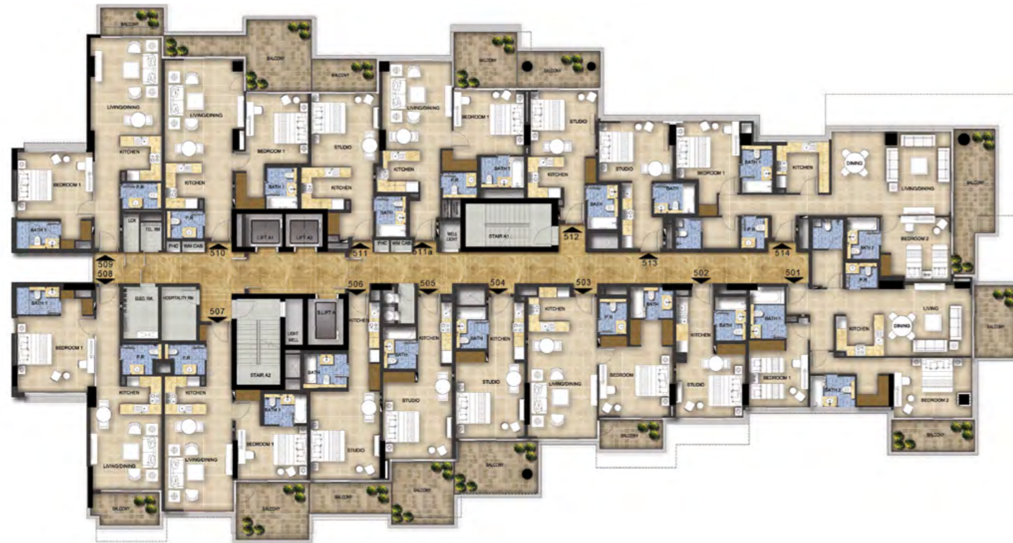
GOLF PROMENADE 2 TOWER B - LEVEL 05