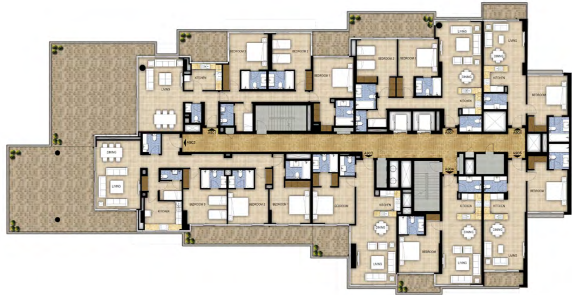
GOLF PROMENADE 3, 4 & 5 TOWER A - LEVEL 09