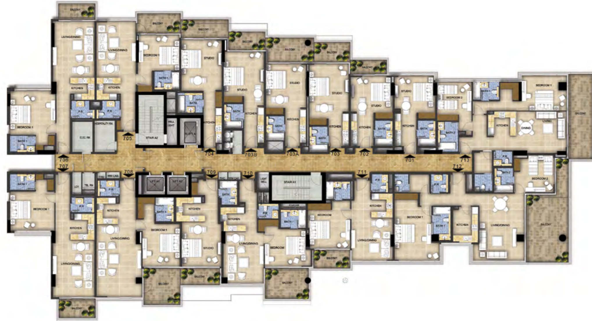
GOLF PROMENADE 2 TOWER A - LEVEL 07