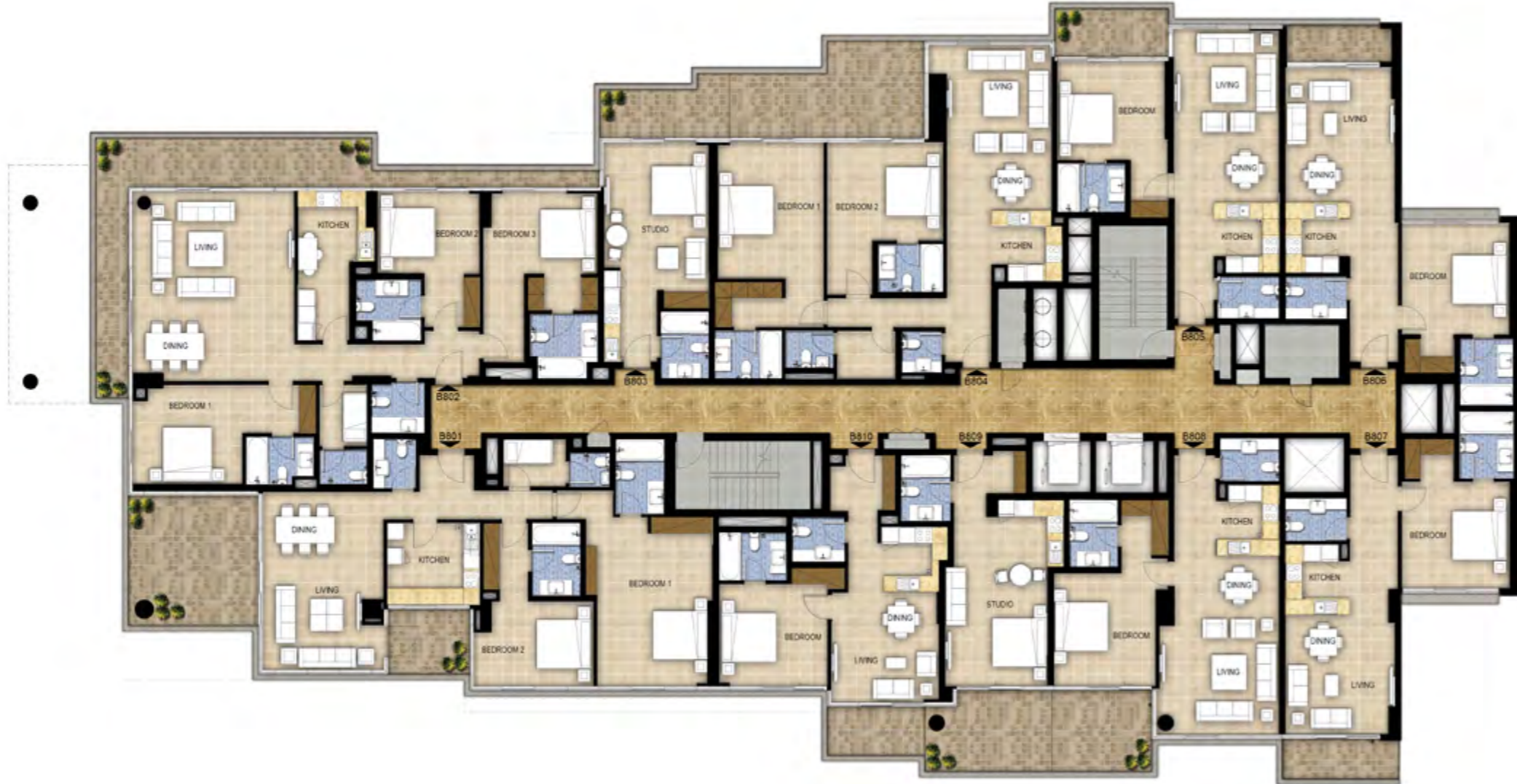
GOLF PROMENADE 3, 4 & 5 TOWER B - LEVEL 08