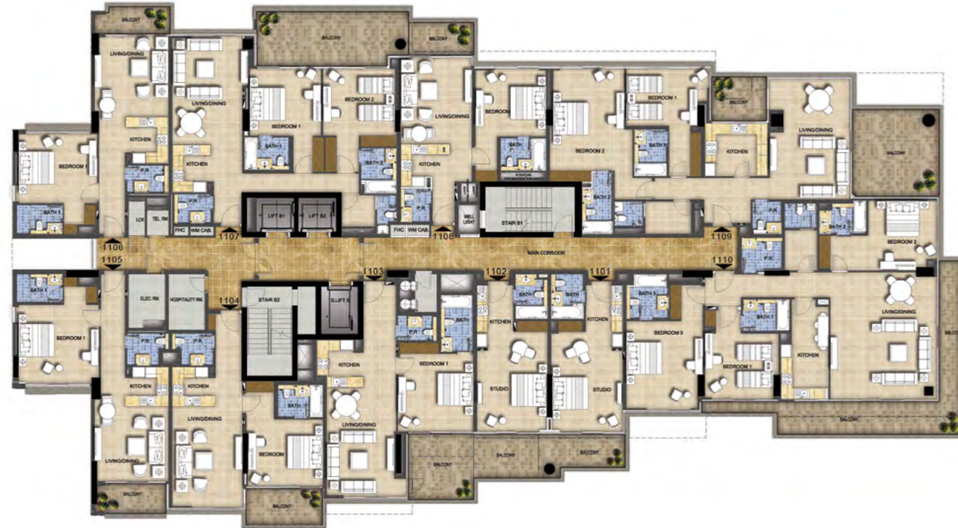
GOLF PROMENADE 2 TOWER B - LEVEL 11