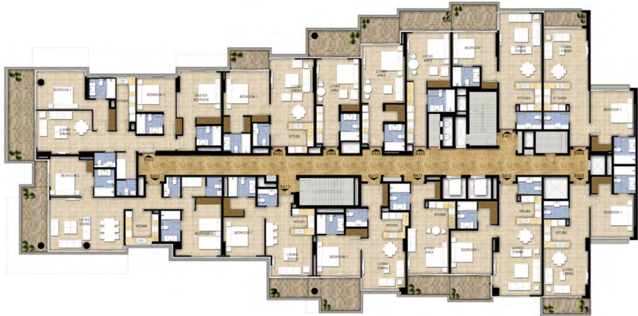
GOLF PROMENADE 3, 4 & 5 TOWER B - LEVEL 04