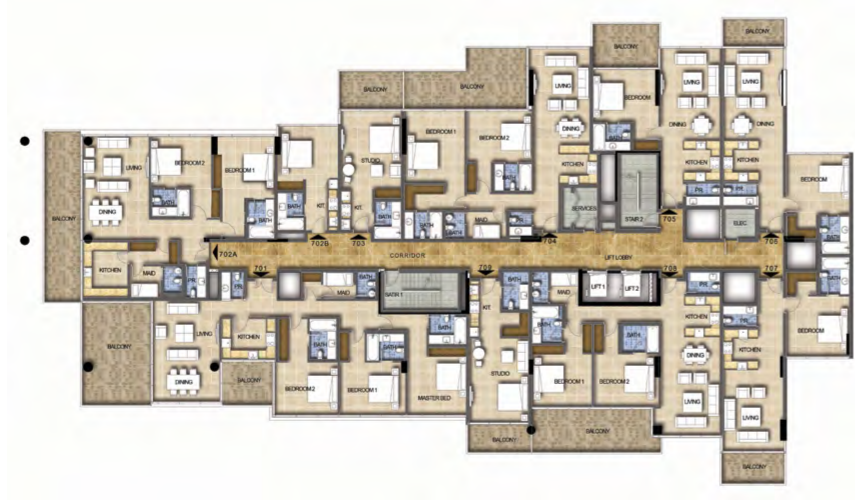
GOLF PANORAMA | GOLF HORIZON TOWER B - LEVEL 07