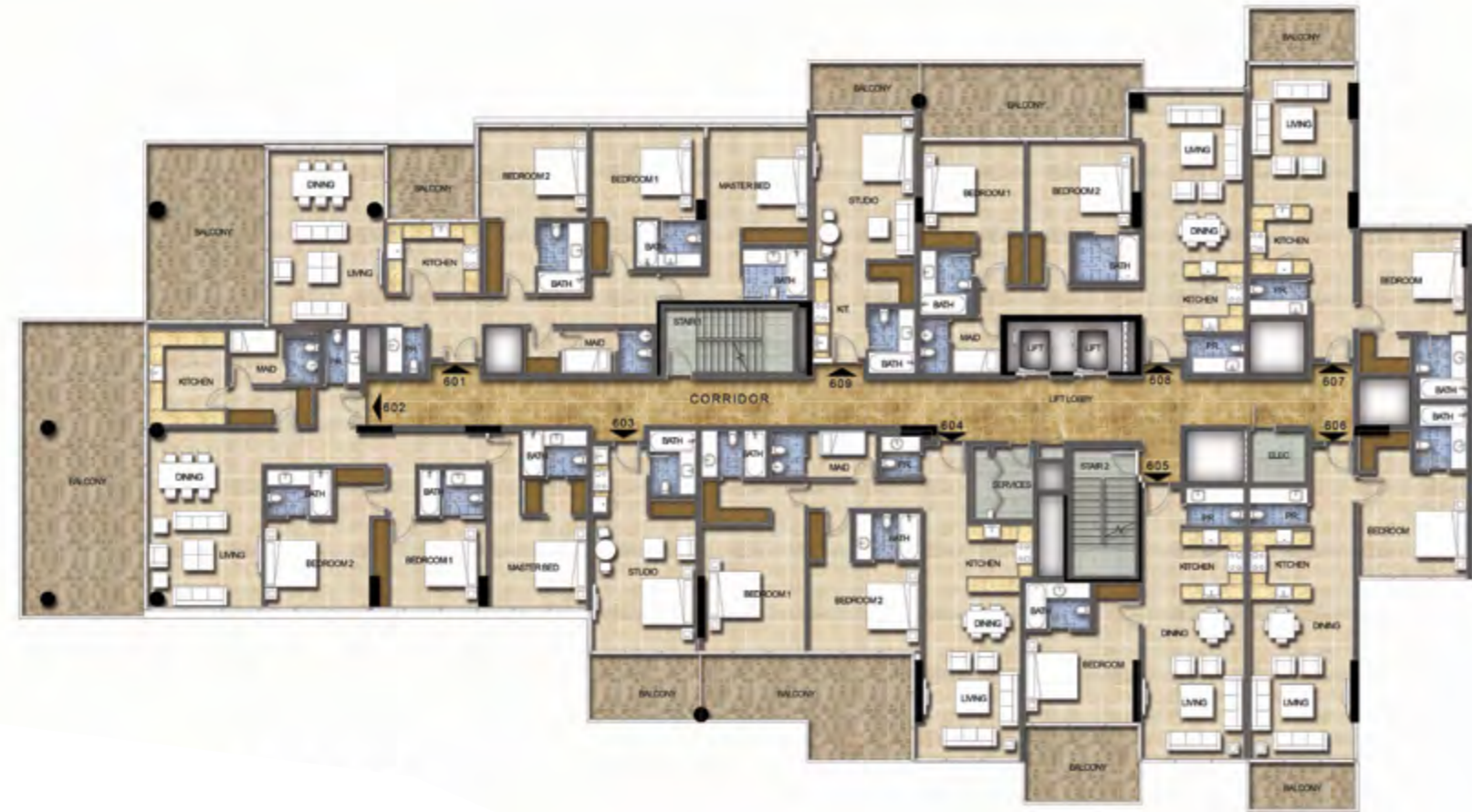
GOLF VEDUTA | GOLF TERRACE TOWER A - LEVEL 06