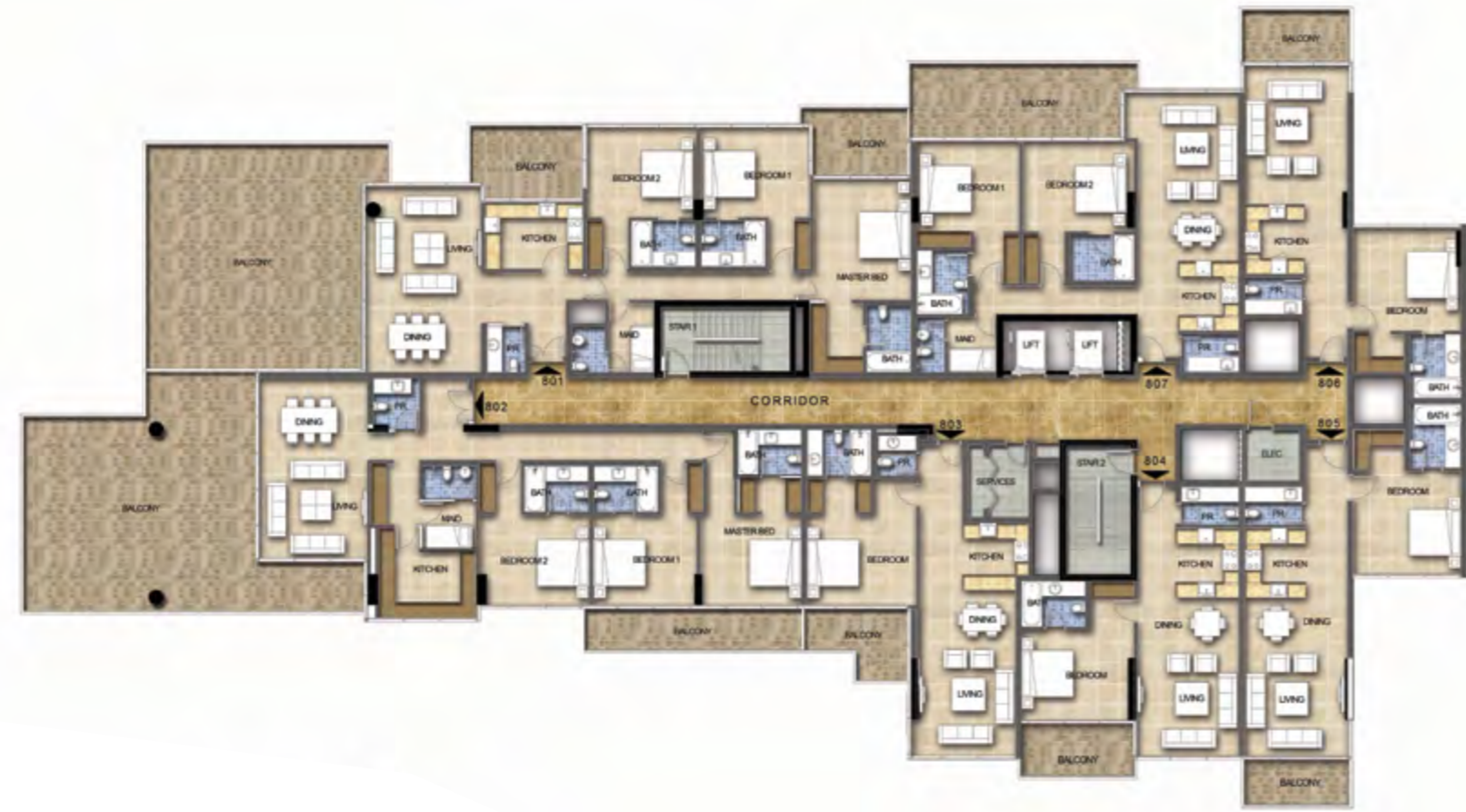
GOLF VEDUTA | GOLF TERRACE TOWER A - LEVEL 08