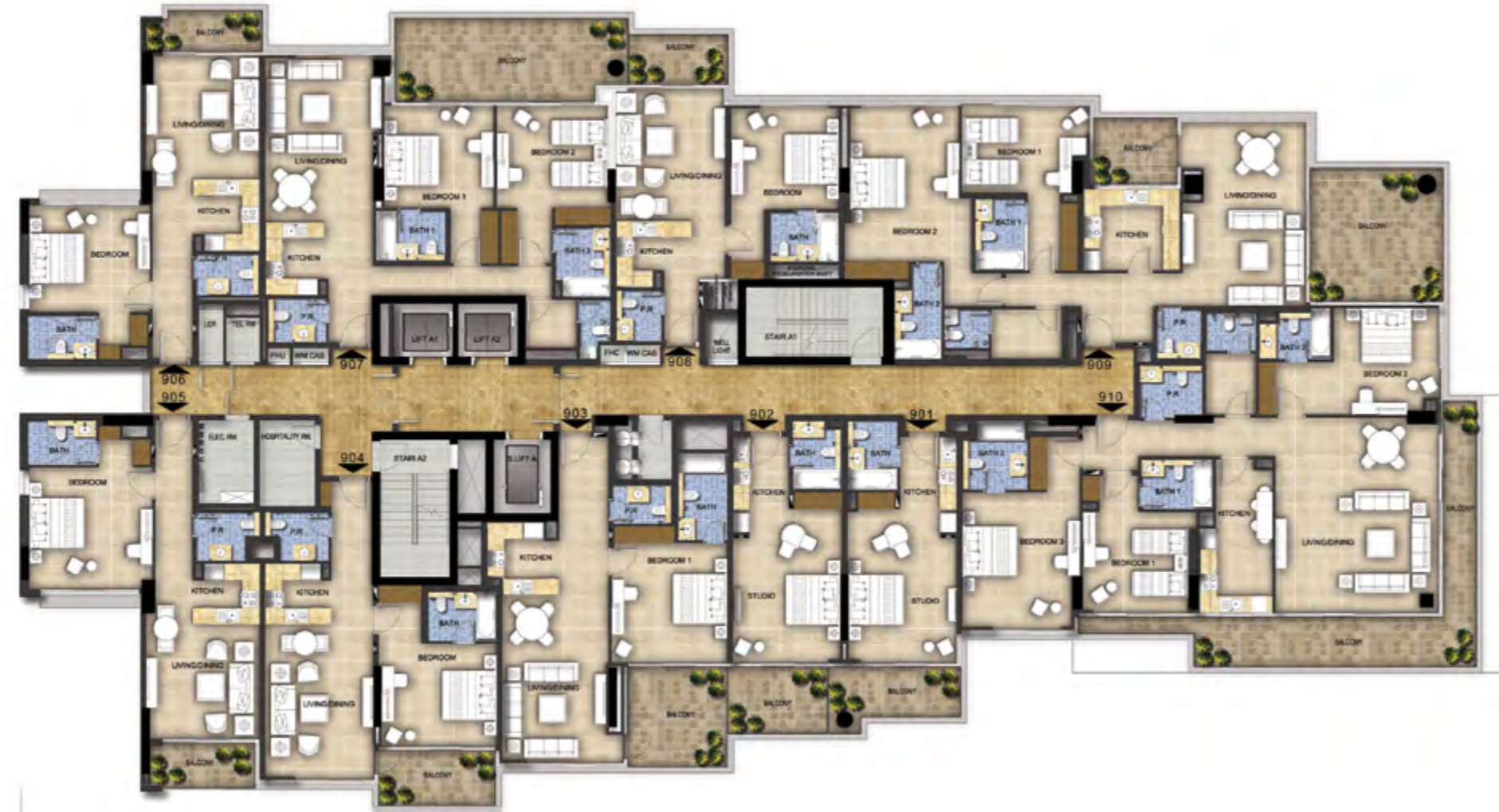
GOLF PROMENADE 2 TOWER B - LEVEL 09