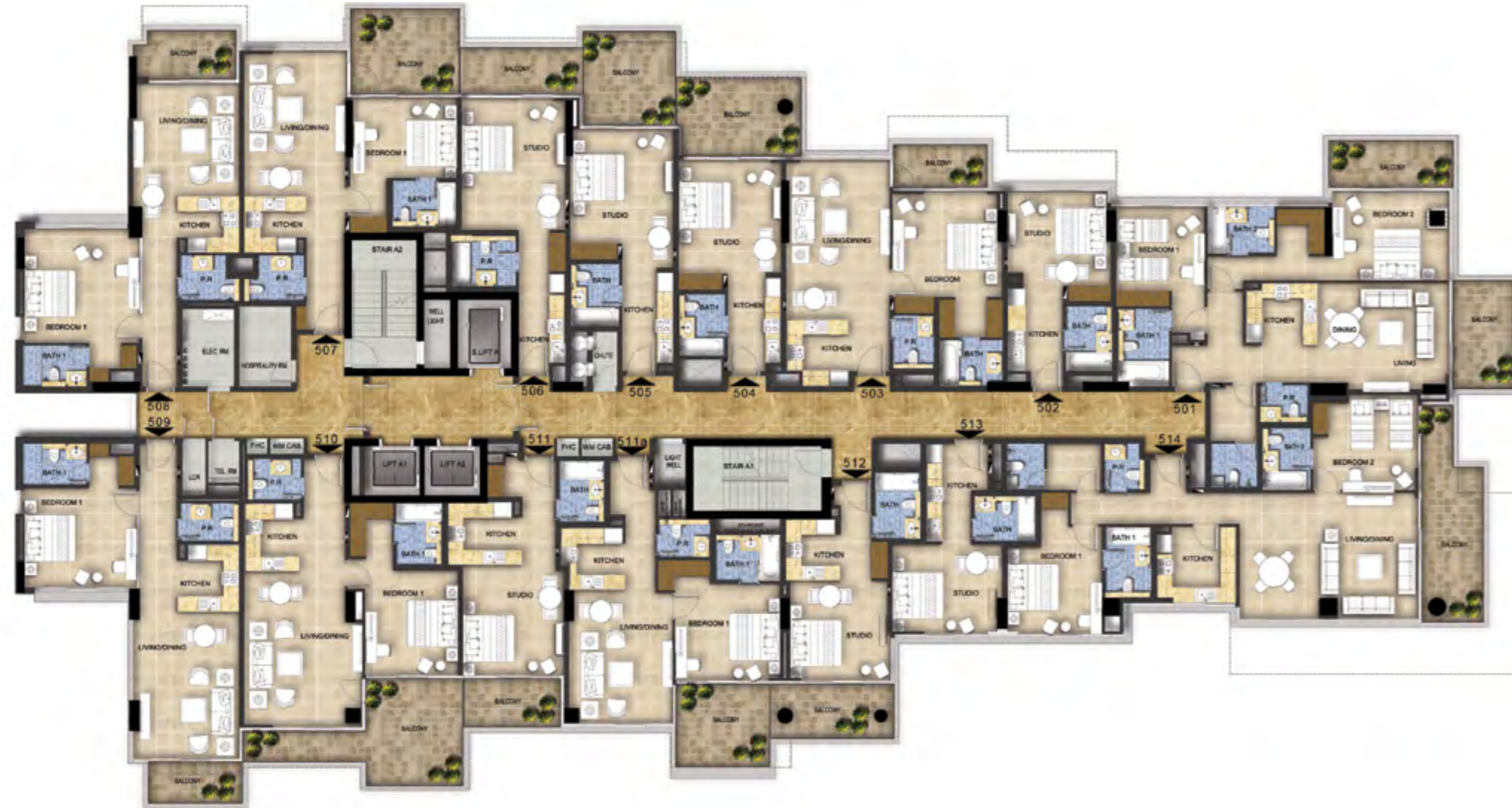
GOLF PROMENADE 2 TOWER A - LEVEL 05