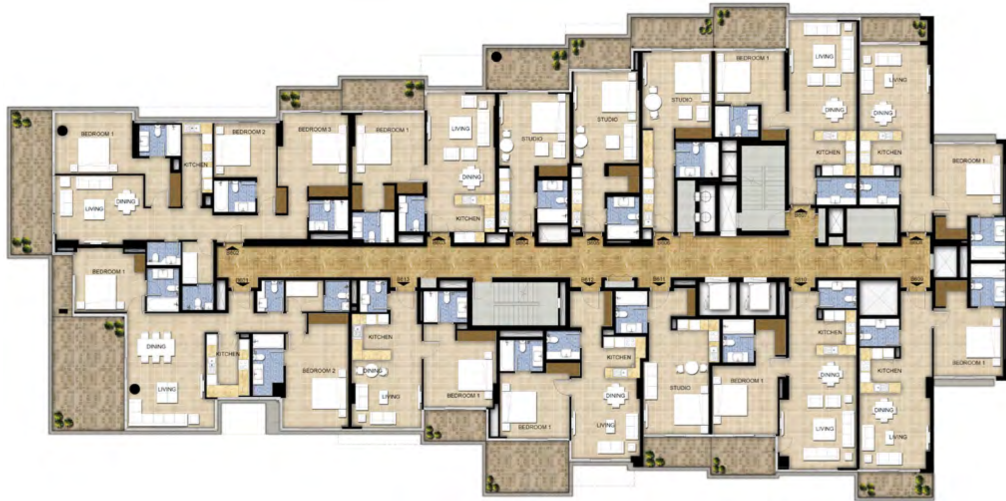
GOLF PROMENADE 3, 4 & 5 TOWER B - LEVEL 06