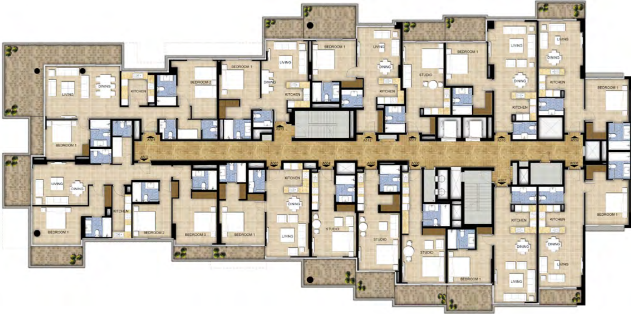
GOLF PROMENADE 3, 4 & 5 TOWER A - LEVEL 05