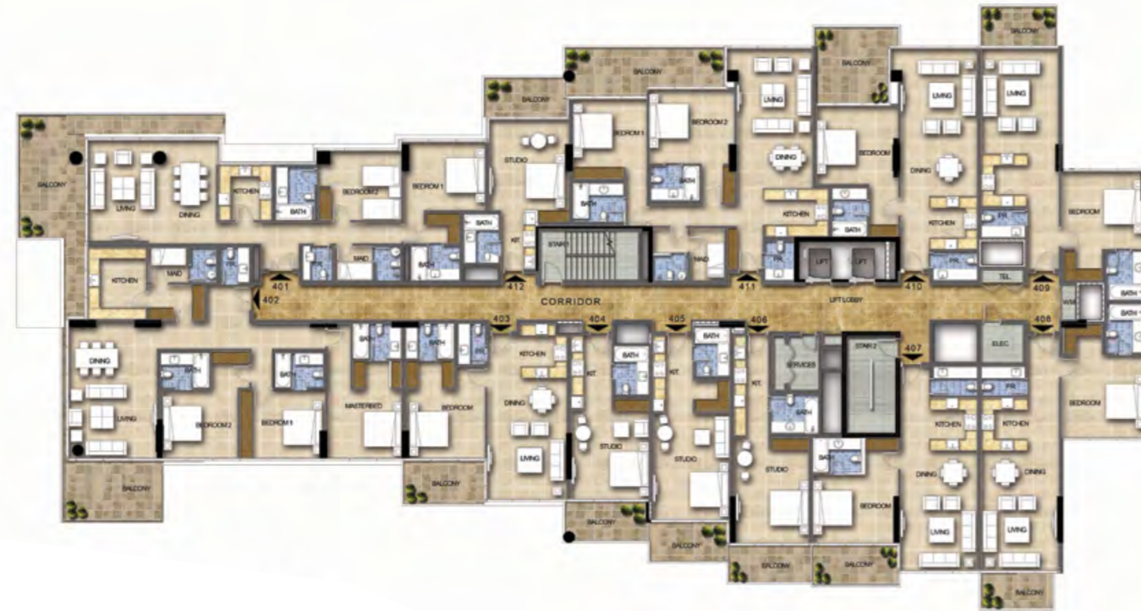
GOLF VEDUTA | GOLF TERRACE TOWER A - LEVEL 04