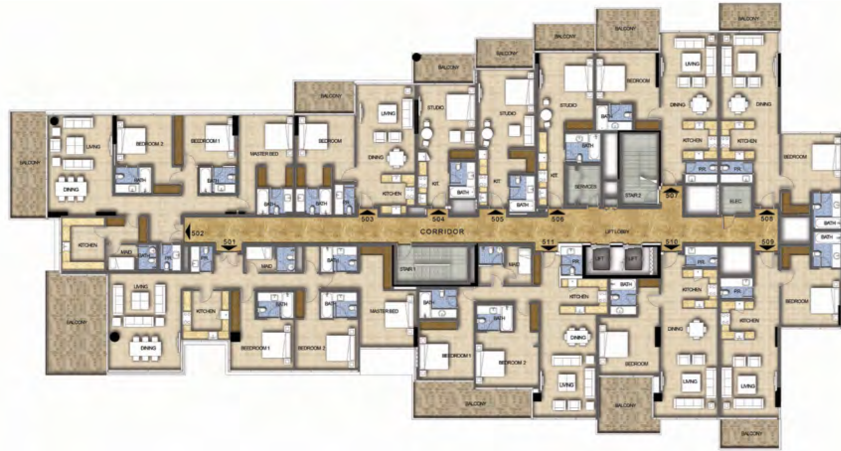
GOLF VEDUTA | GOLF TERRACE TOWER B - LEVEL 05