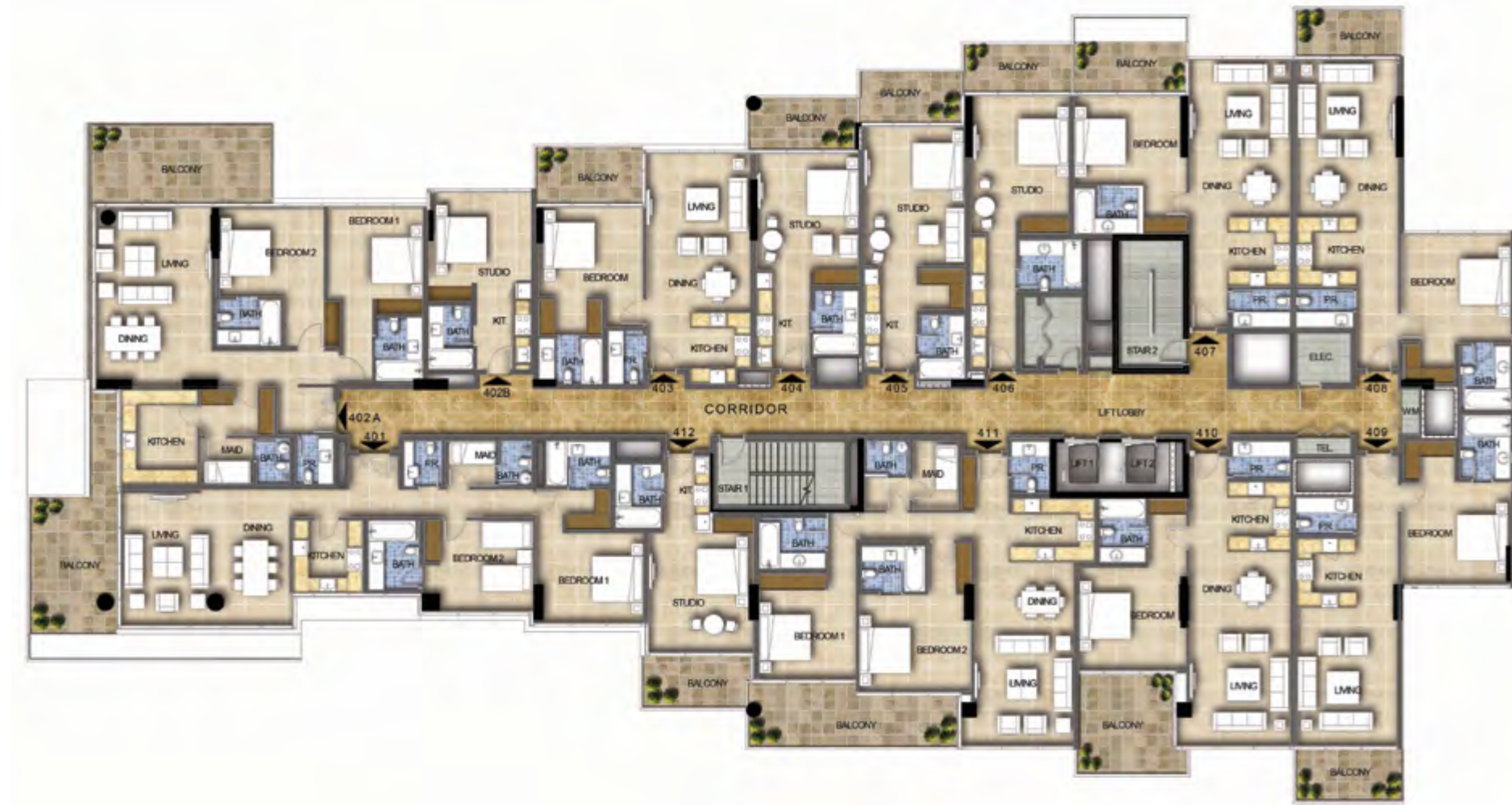
GOLF PANORAMA | GOLF VISTA | GOLF HORIZON TOWER B - LEVEL 04