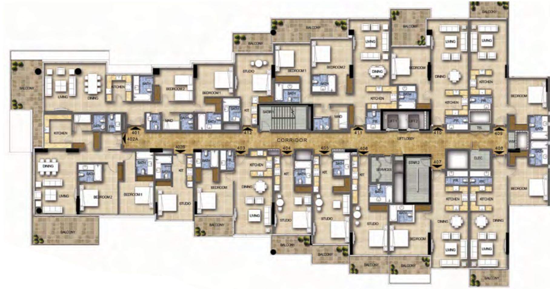
GOLF PANORAMA | GOLF VISTA | GOLF HORIZON TOWER A - LEVEL 04