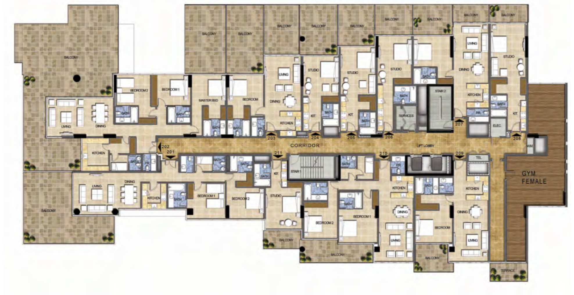
GOLF PANORAMA | GOLF VISTA | GOLF HORIZON TOWER B - LEVEL 02