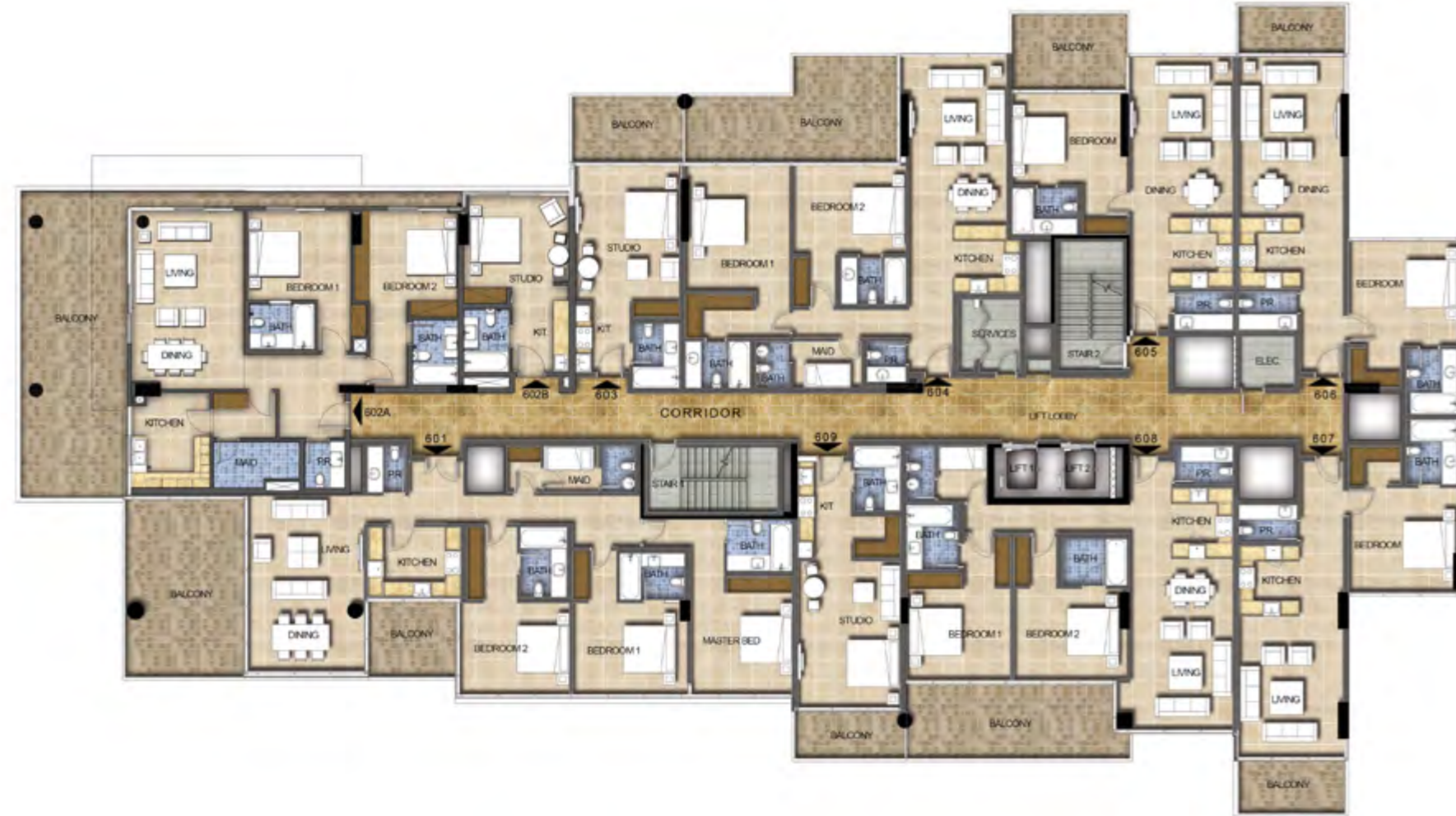
GOLF PANORAMA | GOLF VISTA | GOLF HORIZON TOWER B - LEVEL 06