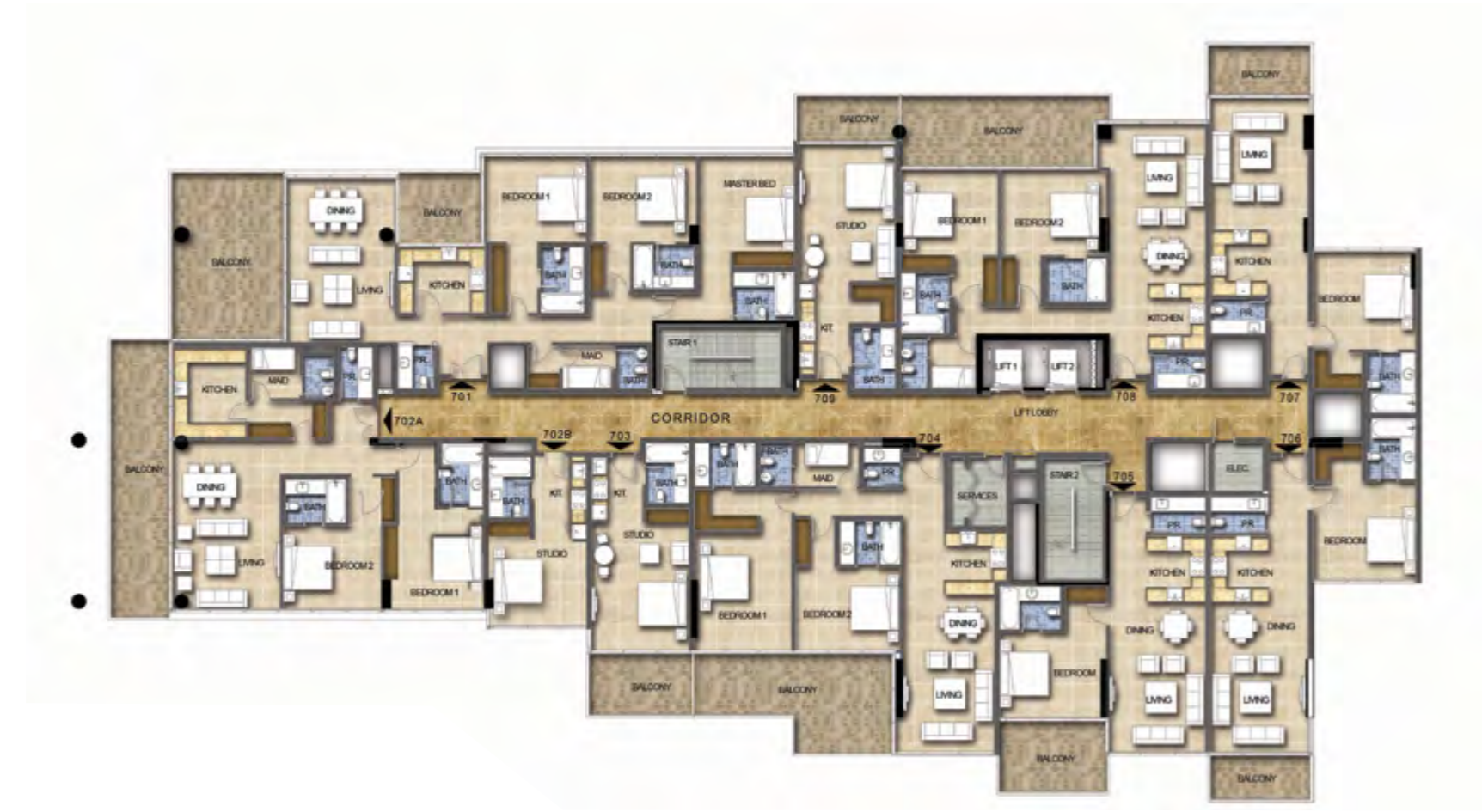
GOLF PANORAMA | GOLF VISTA TOWER A - LEVEL 07