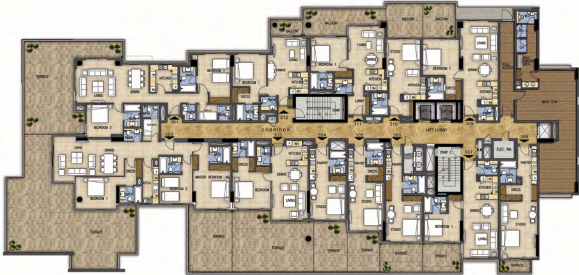
GOLF PROMENADE 3, 4 & 5 TOWER A - LEVEL 03