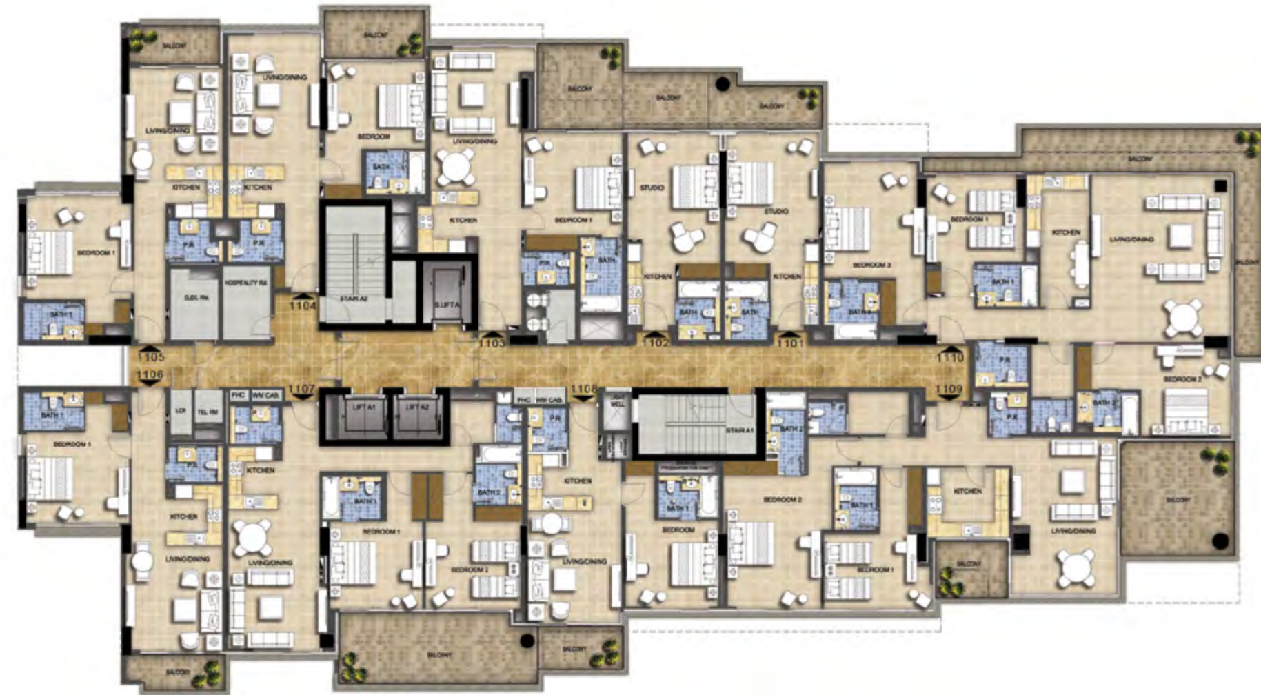
GOLF PROMENADE 2 TOWER A - LEVEL 11