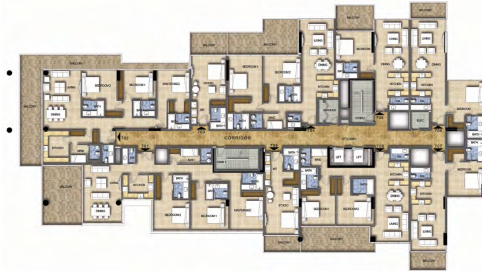
GOLF VEDUTA | GOLF TERRACE TOWER B - LEVEL 07