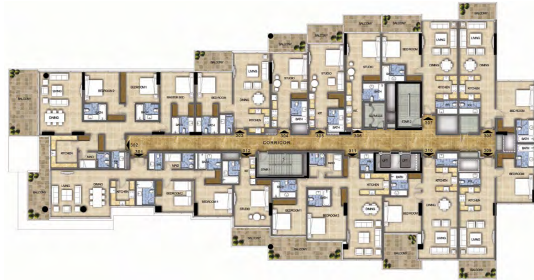
GOLF VEDUTA | GOLF TERRACE TOWER B - LEVEL 03