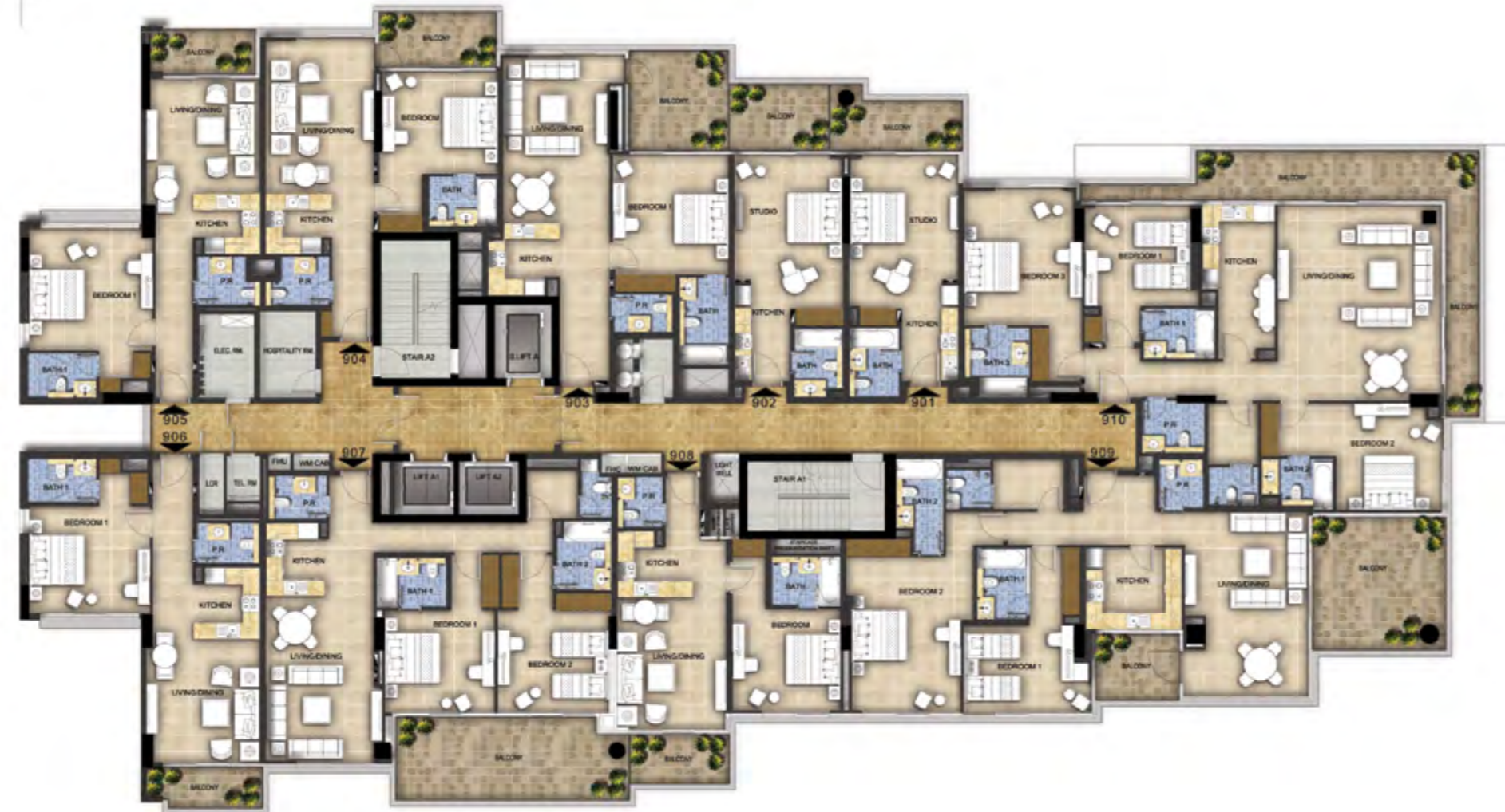
GOLF PROMENADE 2 TOWER A - LEVEL 09