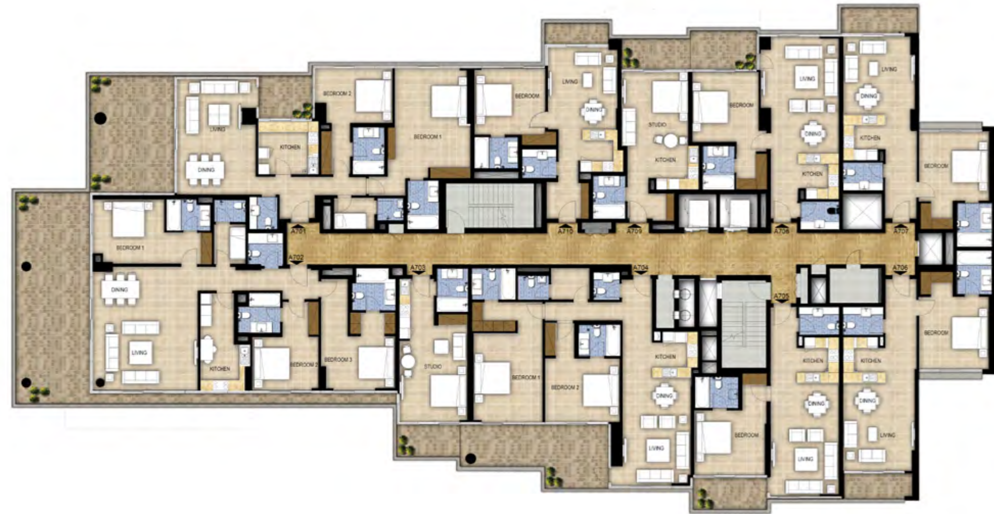
GOLF PROMENADE 3, 4 & 5 TOWER A - LEVEL 07