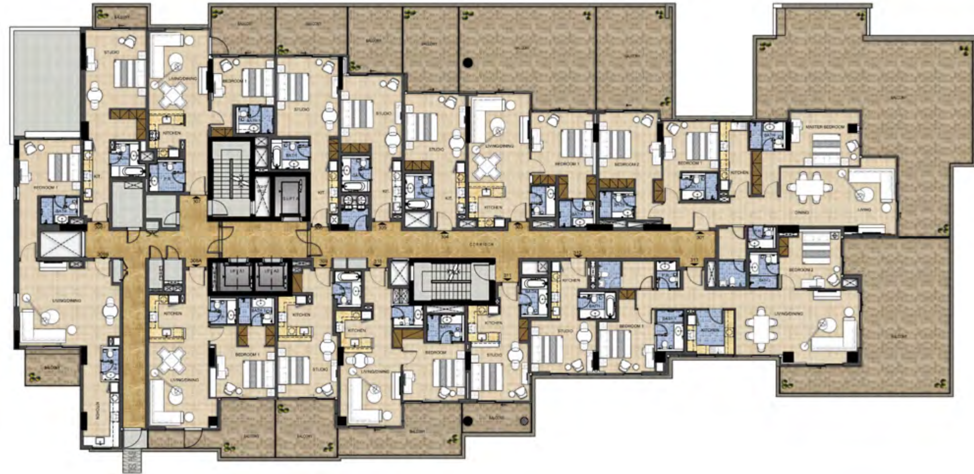
GOLF PROMENADE 2 TOWER A - LEVEL 03